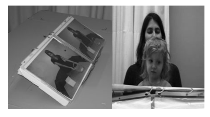
Figure 1 Picture book used in Experiment 1 (left) and a child participating in the task (right).

To start, the book's double-pages were face down behind the bookstand, away from the children. In each trial,