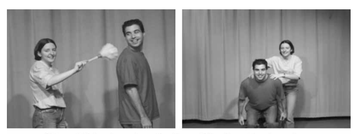
The girl is pimming the boy. The boy is pimming.

The present research asked how children use the alternations shown in (1) and (2) to assign different meanings to causal and unspecified-object verbs. The two alternations are syntactically identical: both involve a transitive and an intransitive sentence. Moreover, the two alternations assign similar roles to the subject and object arguments of the transitive sentence of each pair (1a, 2a): both types of verbs assign the agent of action to the subject position and the recipient of action (the undergoer) to object position. The difference between the two alternations lies in the semantic roles assigned to subject position in the intransitive sentence of each pair. In intransitive sentences, unspecified-object verbs assign the agent to the subject position (2b), just as they do in transitive sentences. In contrast, causal verbs assign the undergoer to this position (1b). In order to assign appropriately different interpretations to novel verbs presented in these two alternations, children must be able to